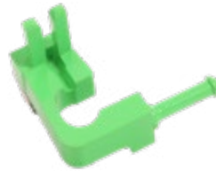
*F - Hi-Visibility Flourescent Green