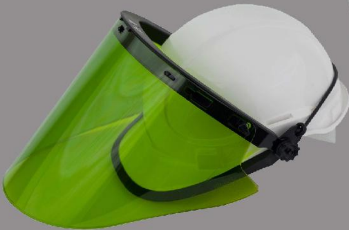
FS18ARC10 ARCSAFE ELVEX ARC SHIELD

Suitable to withstand thermal energy release during ASTM 2178-08 test standard, refer to Hugh Hoagland/ARCWEAR test report 1008F18ARC10, Revision: 01 Brittle temperature, -211 degree F / - 99 degree C