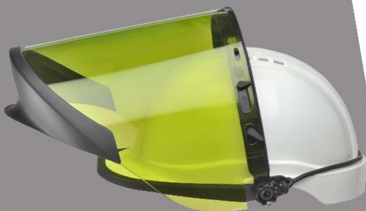
FS20ARC10 ARCSAFE ELVEX ARC SHIELD WITH CHIN CUP

Suitable to withstand thermal energy release during ASTM 2178-08 test standard, refer to Hugh Hoagland/ARCEWEAR test report 1008F18ARC10, Revision: 01 Brittle temperature, -211 degree F / - 99 degree C